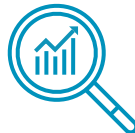
Local Market Expertise